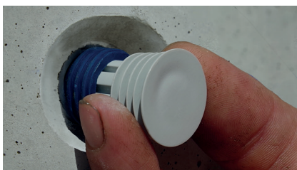
Position the Sealing Plug in the formwork spacer

The Sealing Plug fits in spacers with an inner diameter of 22, 24 or 26mm and can be customized to your specific formwork.