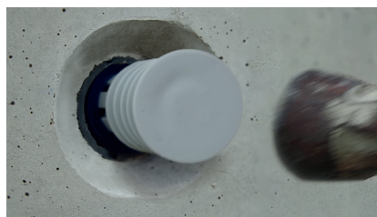
Hammer the Sealing Plug into the formwork spacer