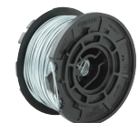
TW1061-S Stainless Steel