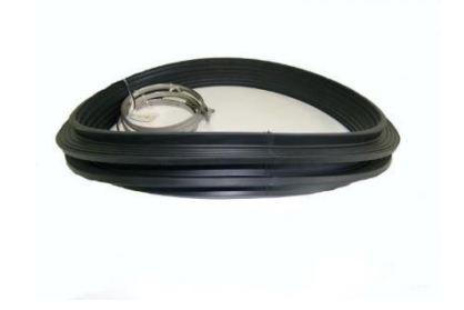
≥ RO 450 (EPDM)