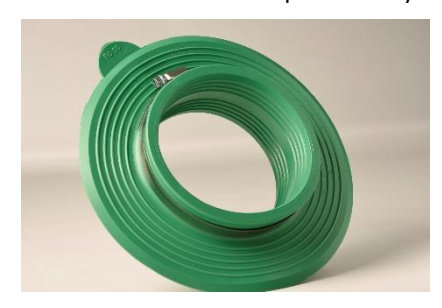
RO 10 – RO 400 (TPE)

We can produce any diameter between 440 mm and 1200 mm