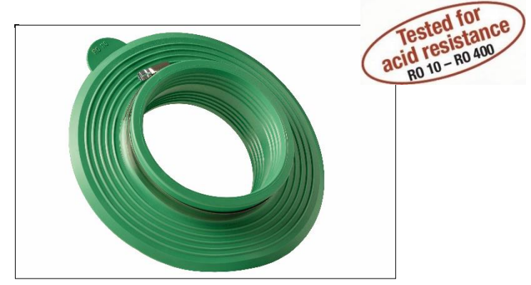
RONDO sealing collars

The RONDO Sealing Collar reliably seals ducts and pipes with smooth surfaces. The openings in concrete floor slabs, walls and shafts are securely sealed against groundwater and pressurised water.